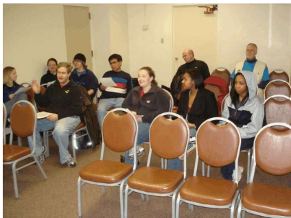
The good news is that many Circle K'ers met at Memorial Union even during mid-term week. The bad news: they still have our gavel.

Besides being energetic, these Circle K'ers are also sneaky! They still have our club gavel!