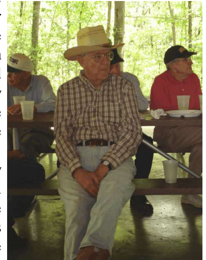
One of the singing cowboys from the picnic